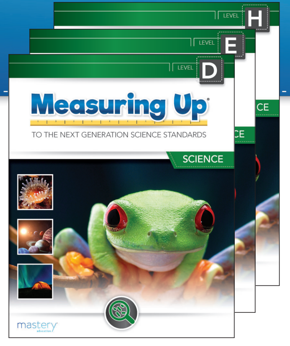
Grades 4, 5 and middle school 6-8

• Comprehensive NGSS-based science content with independent practice items that meet the rigor of the NGSS assessments.